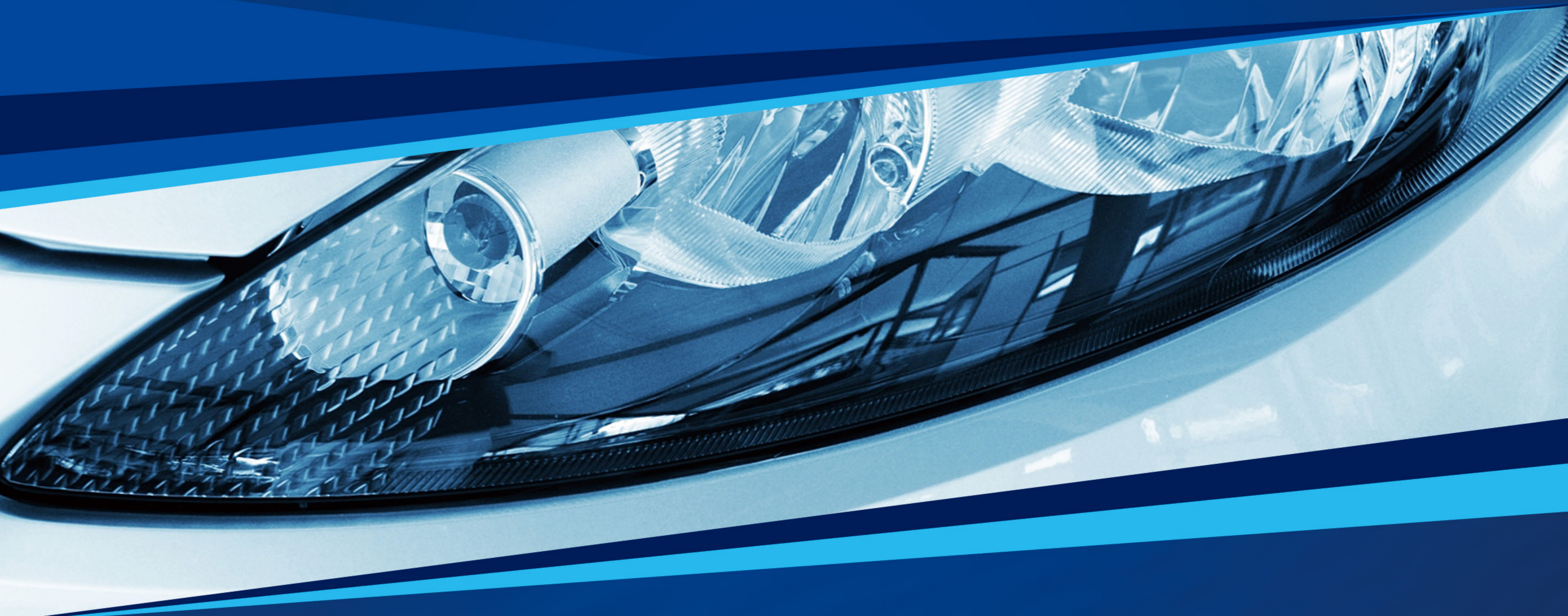
Various processing heads applicable for multiple welding modes